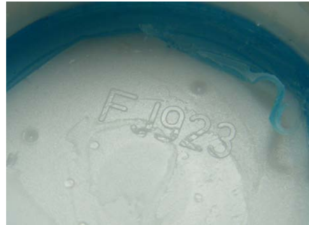
Inside of bottle cap, with plastic liner removed to reveal yet another stamped-in code.

In order to avoid makeh b'patish and other melachos on Shabbos, some people are accustomed to puncture the cap of carbonated beverages before twisting them off. The pictures above show, however, that there may be another problem with puncturing – that of mechikah, the destruction of lettering, when the knife pierces symbols which are hidden from view.