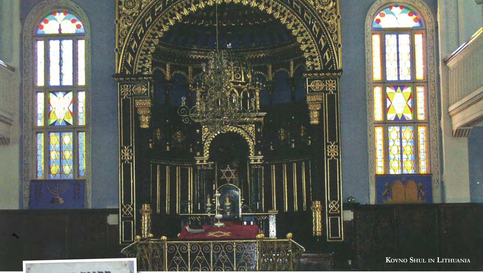
KOVNO SHUL IN LITHUANIA