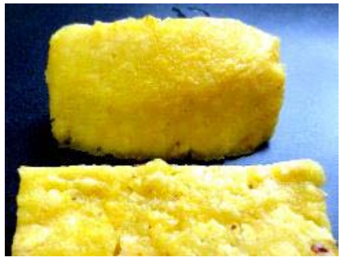
Correct – no brown holes on fruit