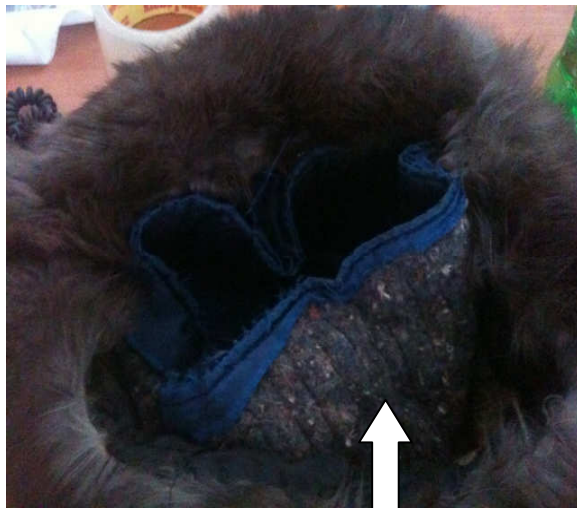
Fig 2: Padded with Recycled

The two Russian fur hats pictured above were brought to the Pinsk Shatnez Laboratory for testing. One was padded with raw cotton. The other one was padded with colorful recycled materials.