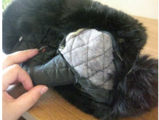
Fig 4: Padded with Recycled

A Golden Swallow (China) fur hat was brought to the Chicago Shatnez Laboratory for testing. It was also found to be padded with recycled materials.