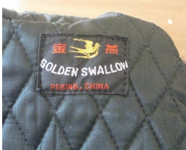
Fig 3: Fur hat made in China